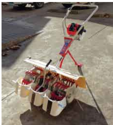
Hand and motorized mechanical weeders.