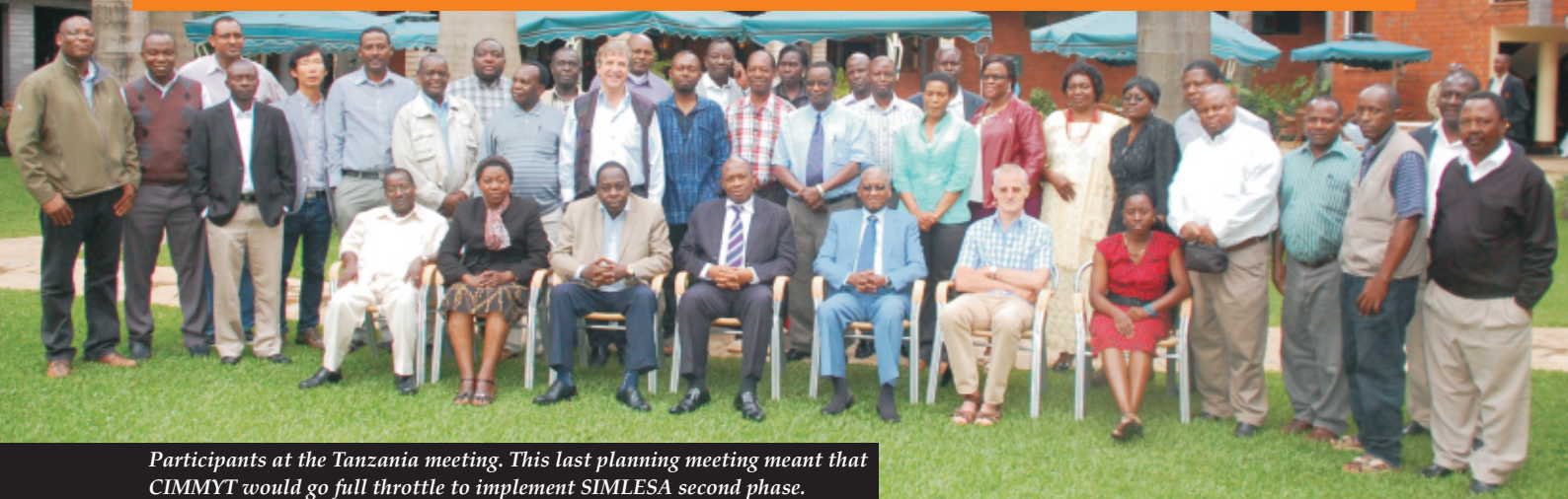
Participants at the Tanzania meeting. This last planning meeting meant that CIMMYT would go full throttle to implement SIMLESA second phase.