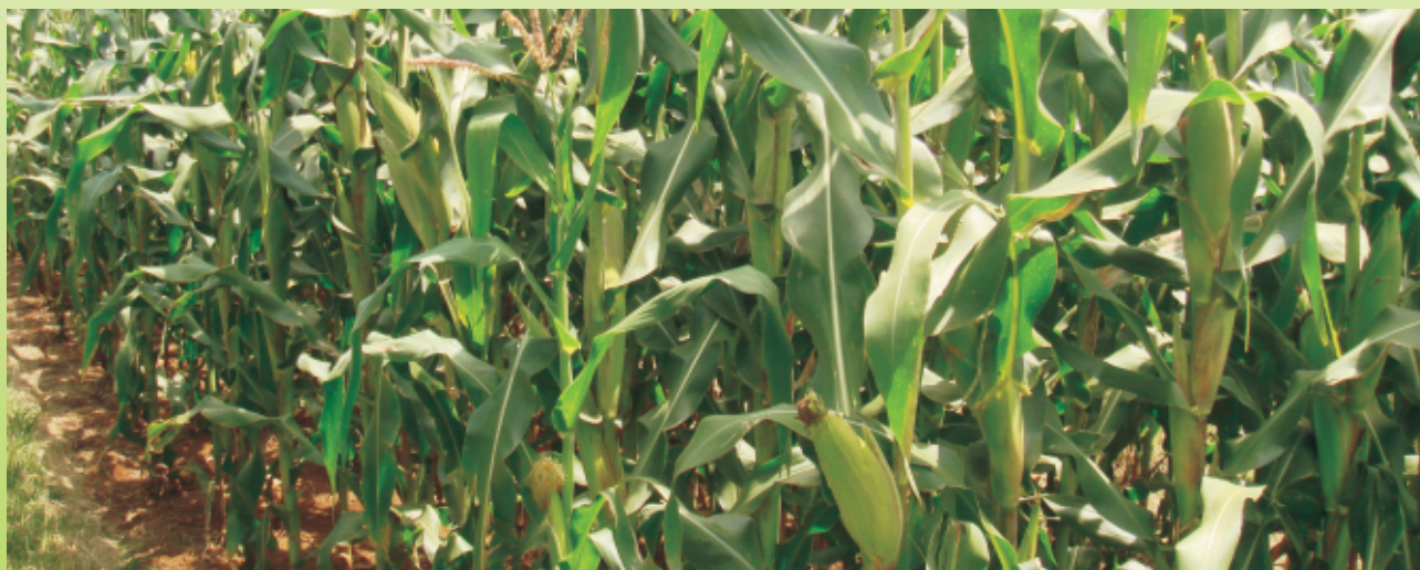
Mega demonstration plots, such as the one in the picture, are learning centers implemented by SIMLESA in eastern Kenya to promote smallholder agriculture and bring together farmers, Ministry of Agriculture staff, agro-dealers and other relevant stakeholders.

Maintenance of existing on-farm exploratory and demonstration plots and conducting field days were suggested to improve knowledge sharing in eastern Kenya. Exchange visits for IP members were also recommended to expose participants to knowledge beyond their region.