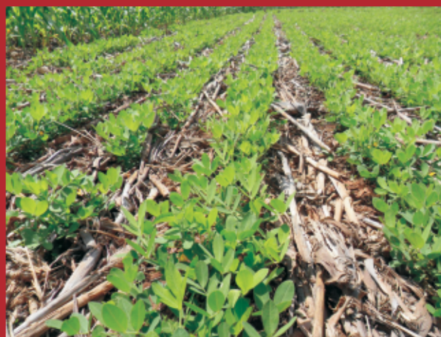
Smallholder farmers in the two districts adopted conservation agriculture, such as mulching, and are moreover scaling out the technology to other farmers.

promoted practices. Fifty-three farmers in the two districts adopted CA and are moreover scaling out the technology to other farmers. The farmer field schools approach has been established through early adopters who each assist at least 10 farmers: Rwanda holds much agricultural potential to improve smallholders' productivity and yields.