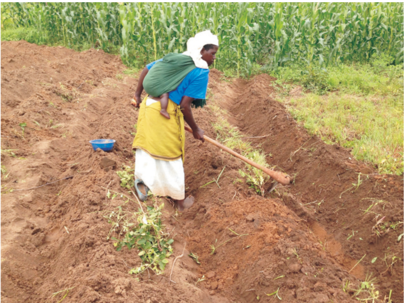
Maize and legumes intercropping is a common practice especially in southern Malawi where average land holdings are small.

In addition to the testing of these technologies on these core on-farm exploratory trials, SIMLESA also embarked on an outscaling drive in which the core farmers graduated to become lead farmers building capacity among their peers. Each lead farmer is expected to work with at least 10–15 other farmers through simplified outscaling trials in which each farmer uses the traditional ridge-and-furrow system plus one other CA technique of their own choice. The lead farmers teach other farmers using their own land as demonstration plots. Most of this was facilitated through local innovation platforms which sought to facilitate improved access to inputs and to markets, farmer learning and knowledge exchange.