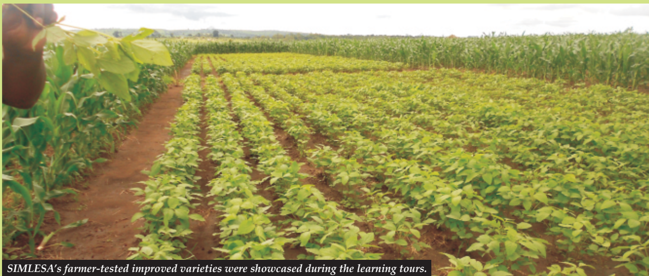
SIMLESA's farmer-tested improved varieties were showcased during the learning tours.