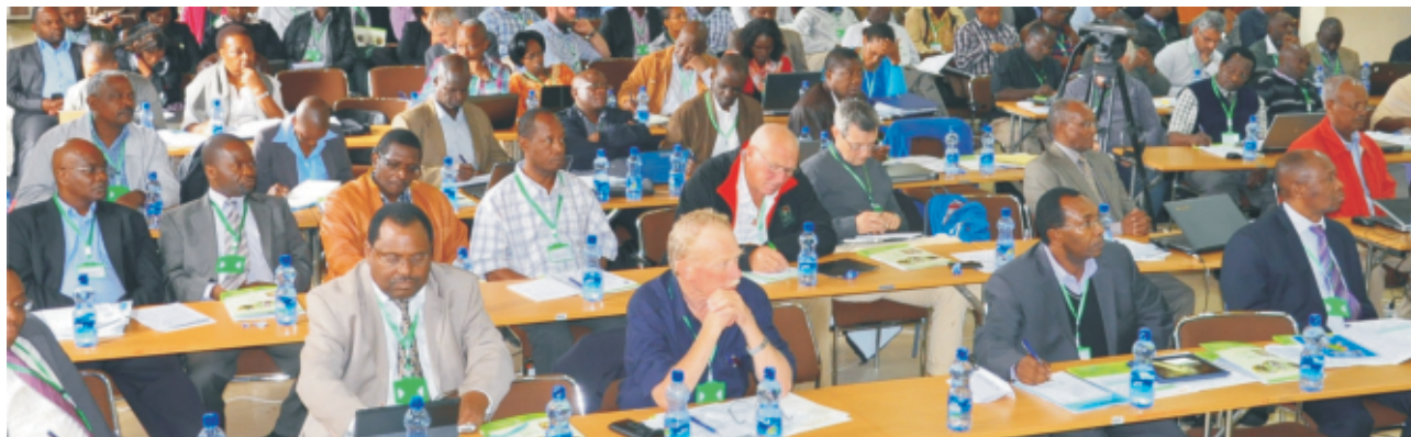
Participants at the SIMLESA Phase II launch. All the participants agreed on an implementation plan that was further refined at national level during country - specific planning meetings.

A joint meeting with SIMLESA country coordinators was held on July 3–4. The coordinators presented achievements of the first phase, plus the challenges and strategic plan for the second phase. Planned project activities for the second phase are not homogeneous across the SIMLESA countries; they are guided by the country's priorities, the level of support required and the opportunities for scaling out. Discussions centered on strategies to scale out new technologies to more than 650,000 small-scale farmers by 2023.