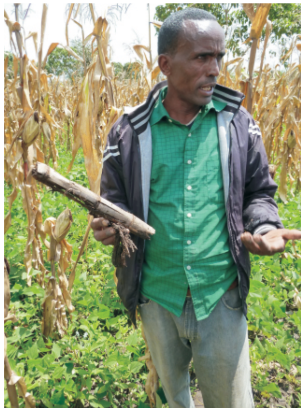
Men and women should participate effectively in agricultural development. Above, an Ethiopian farmer explains the devastating effects of striga infestation.

Looking ahead, what will it take to successfully integrate gender? Success on gender in SIMLESA will not entirely depend on what individual SIMLESA gender experts do. Rather, it is our collective commitments, responsibilities and efforts that matter. After all, many of the gender-relevant activities will be led and carried out by other SIMLESA team members who are not necessarily gender specialists. In most cases, project teams never lack commitment to gender: what usually limits them is clarity on what needs to be done. With the SIMLESA gender team in place, a solid strategy and a robust M&E framework, SIMLESA has no excuses.