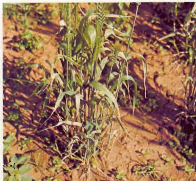
Only a few seeds of the F1 generation are available from each cross for planting in the CIMMYT nursery, Njoro. Each lot of F1 seeds is planted as a group in a "hill" (as opposed to rows), to conserve nursery space.

The size of the operation can be measured by the fact that in 1978 over 23,000 entries were sown. The disease pressure is so great at Njoro that of these, only 1,775 introductions survived (7.7 per cent). Yield nurseries