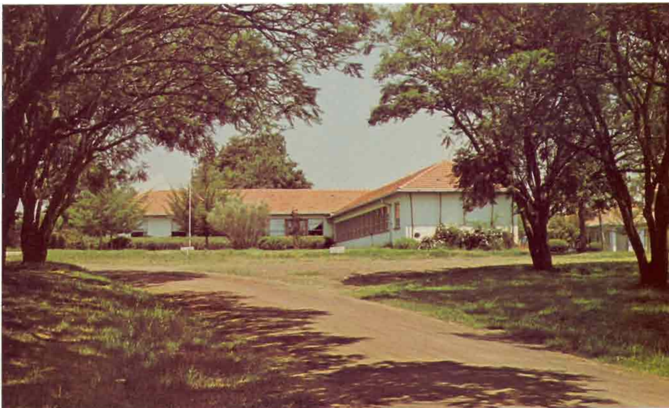
Some laboratory buildings at the National Plant Breeding Station, Njoro, Kenya. The station was established in 1927. CIMMYT screened over 23,000 lines at this station in 1978.

There are many important wheat diseases in the regions in which ICARDA operates. In north and north eastern Syria, the principal diseases are the three rusts. In North Africa, Saudi Arabia, South Yemen, North Yemen and Oman, the three rusts are very important. Septoria is prevalent mainly in North Africa and along the eastern Mediterranean coasts. Scald and Helminthosporium spp. are important diseases on barley everywhere in the region. Other barley diseases of importance are the three rusts, powdery mildew and smut. In Iraq, Syria and Iran, loose smut is widespread.