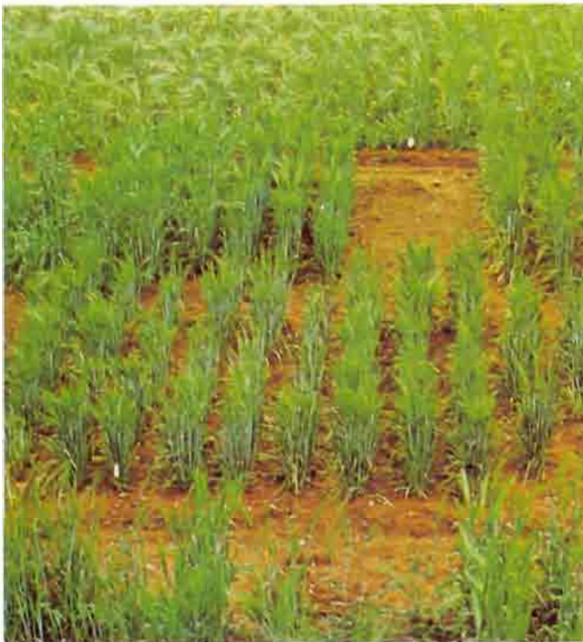
Barley from Delhi is being grown in rows at the Wellington Research Station, India, for disease screening purposes.

Although stripe rust is present, spores from this source are unable to move out to infect the northern Indian wheat areas. Stripe rust only occurs in a damaging form in the north, where its source of spores is the Himalayan foothills. It will not live on the southern plains, because temperatures are too high throughout the year.