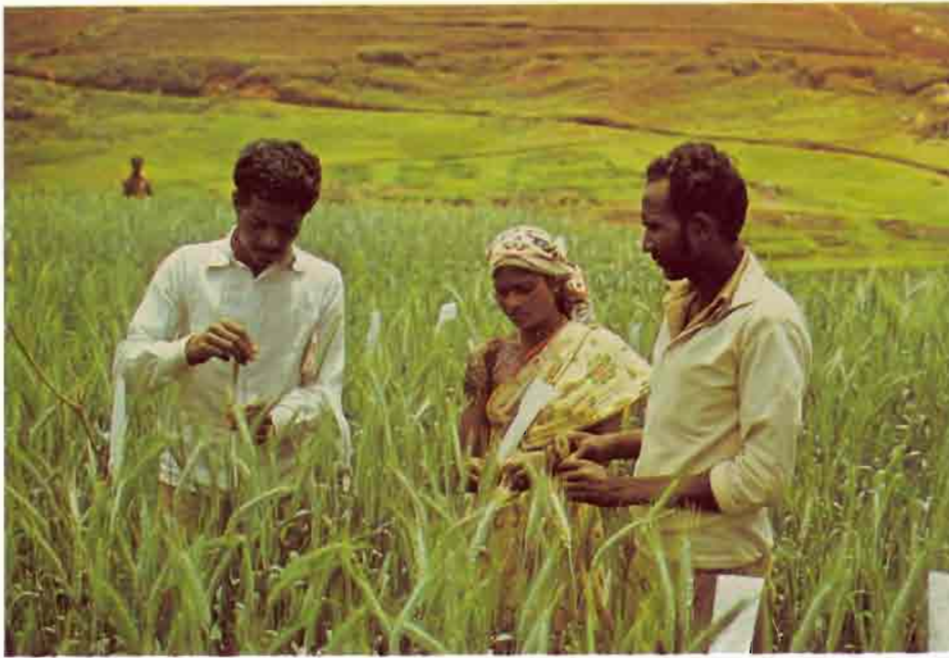
Wellington Research Station staff in India, making crosses among triticale plants.

Although stripe rust is present, spores from this source are unable to move out to infect the northern Indian wheat areas. Stripe rust only occurs in a damaging form in the north, where its source of spores is the Himalayan foothills. It will not live on the southern plains, because temperatures are too high throughout the year.