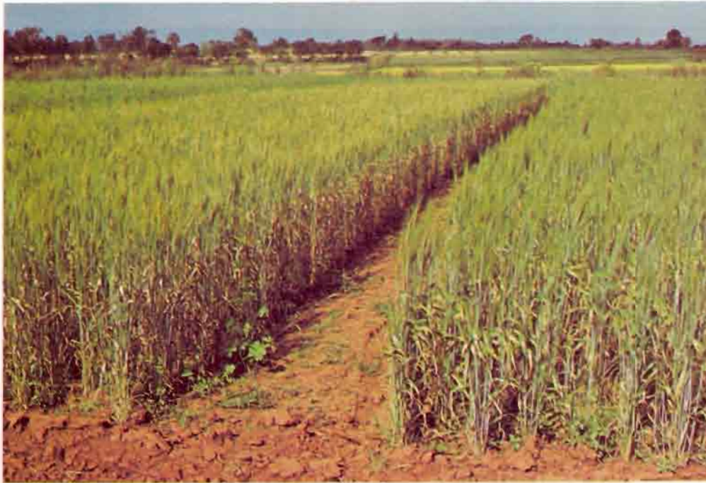
Wheat plots at the National Plant Breeding Station, Njoro, Kenya. The variety (left) is K. Swara showing stripe rust infection in the head (yellow color) and in the leaves. By contrast K. Kanga (right) is resistant and the plants are still green.

of bread wheat, durum wheat, triticale and barley were grown. Other nurseries included the Stem Rust Parental Nursery, the Stripe Rust Parental Nursery, the Mid East Regional Disease and Insect Screening Nursery, the Regional Disease Trap Nursery and the Screening and Yield Nurseries of the African Cooperative Wheat Trials, as well as all CIMMYT's international materials.