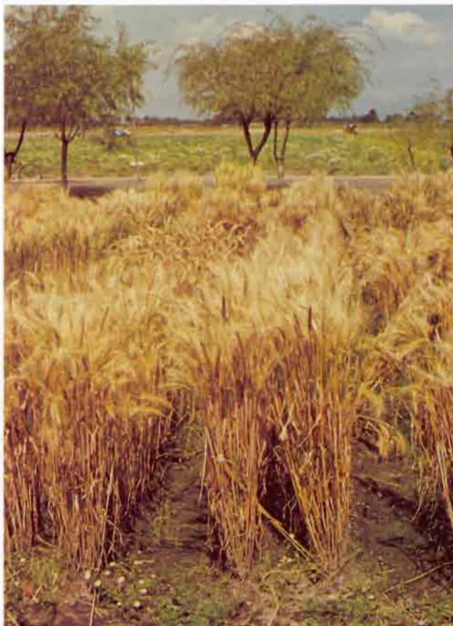
Stripe rust screening is carried out in rows in the summer nursery at the CIMMYT station near Toluca, Mexico.

Each year, a number of integrated operations take place: In Obregon : Sowing commences during early to mid November and harvest begins in April and continues to early May. At Toluca and El Batan : Later maturing material is sown in the first week of May and all plantings are completed by the end of the month. The harvest period for this season commences in the first week of October and continues to the first week of November.