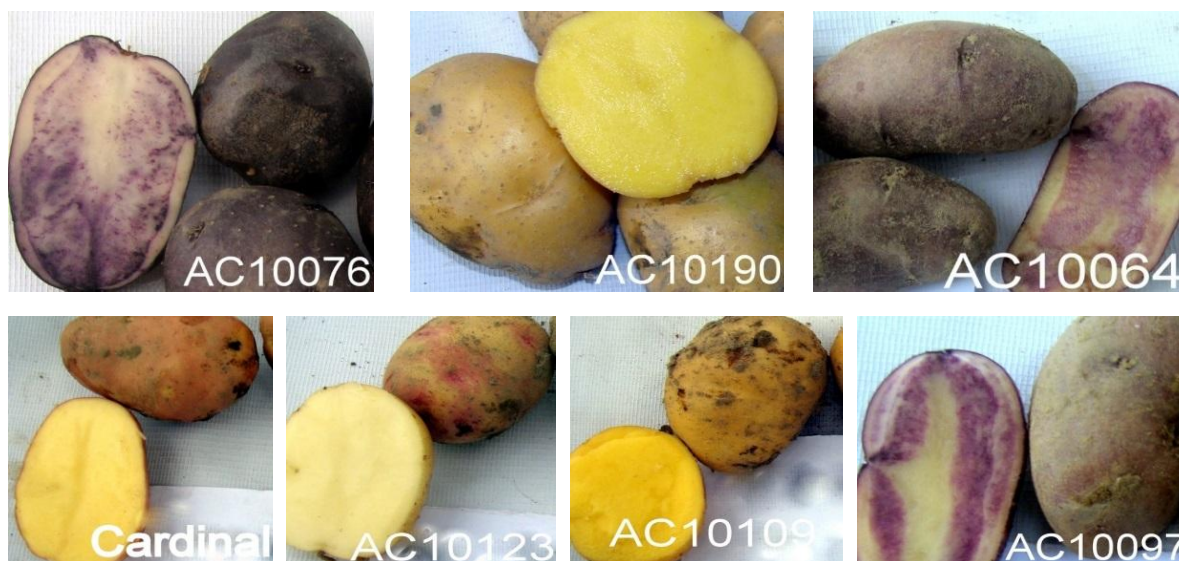
Fig. 3. Photograph showing the tubers outer and inner colour of different accessions of potato