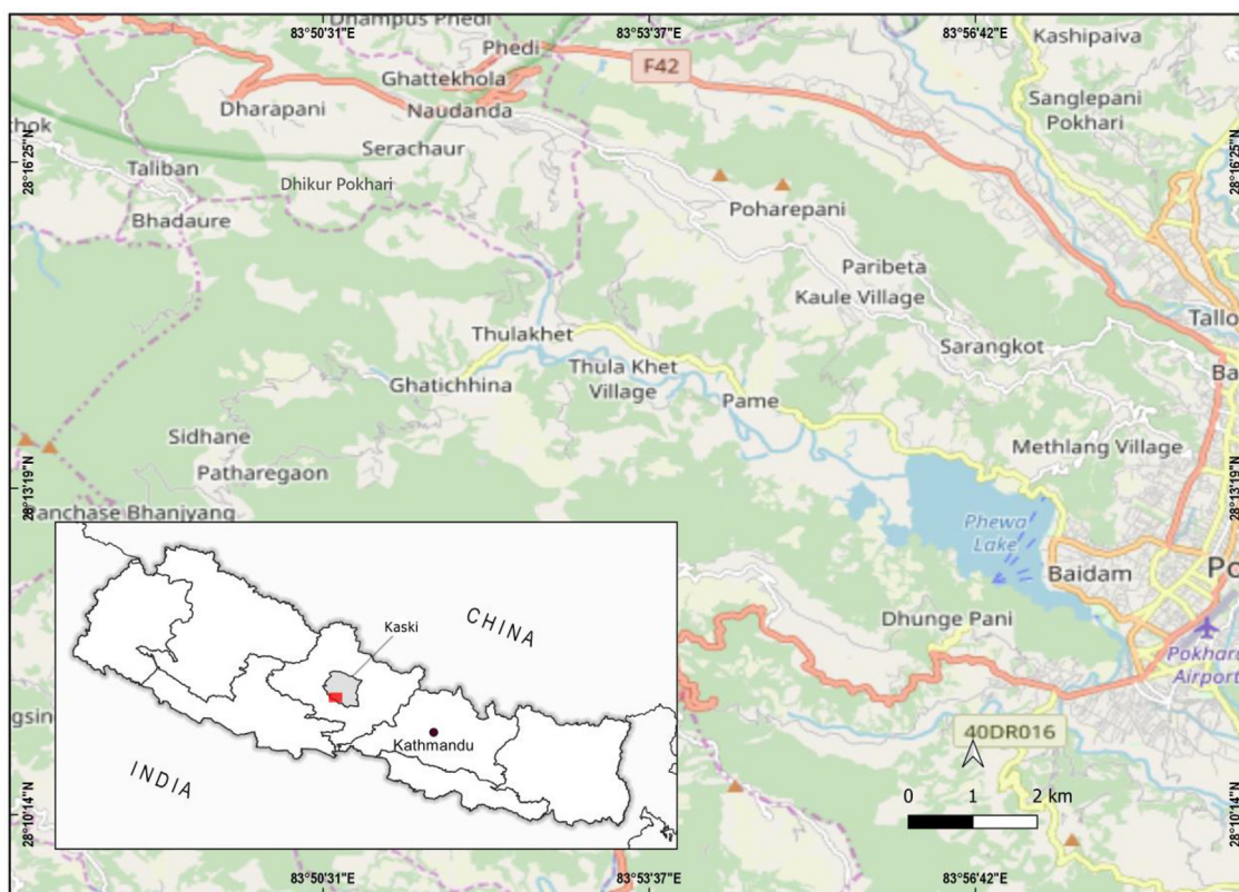
Fig. 1. Map of Nepal showing the research areas in Kaski district.

passed down from their ancestors for generations and the food habits of their children: What were they are going to eat if they did not grow or learn about food? These conversations highlighted the importance of food literacy and the sustainability of small family farms in Nepal.