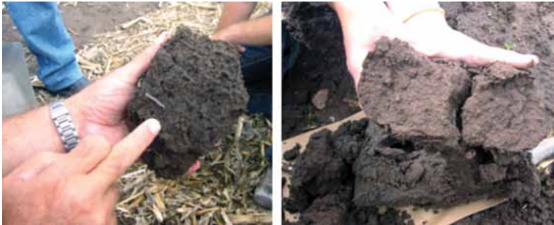
Fig. 2. Soil aggregates; on the left, clear structure and aggregates with soil fauna present; on the right, dense structure and fewer aggregates than on the left.