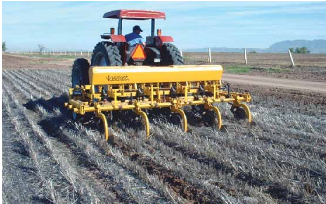
Fig. 1. Permanent raised beds with furrow irrigation. The beds are not tilled but only reshaped as needed between crop cycles. One to four rows are planted on top of the bed, depending on the bed width and crop, with irrigation applied in the furrow. Residues are chopped and left on the surface.

Soil structural stability is the ability of aggregates to remain intact when exposed to different stresses. Shaking of aggregates on a wire mesh both in air (dry sieving) and in water (wet sieving) is commonly used to measure aggregate stability. With dry sieving, the only stress applied is the one from the sieving, while with the wet sieving the samples are additionally exposed to the power of the water (slaking). Therefore, the mean weight diameter (MWD) of aggregates after dry sieving is generally larger than the MWD after wet sieving. In the following, we will discuss the three elements of CA and their influence on physical soil quality.