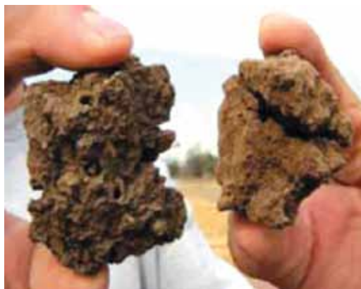
Fig. 4. Differences in aggregation between conservation agriculture (left) and conventional management (right). After 5 years of zero tillage on permanent raised beds, the soil had significantly more stable aggregates compared to conventional tillage.

Altering crop rotation can influence soil organic carbon by changing the quantity and quality of organic matter