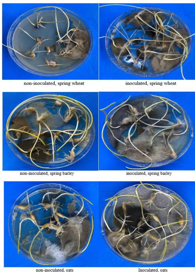
Fig. 3: Seedlings of grain crops on the 10 th day after inoculation with a suspension of Bipolaris sorokiniana

Thus, we assume that the introduction of rapeseed, chickpea, pea, and oat seeds into crop rotation limits the infectious load of the fungus B. sorokiniana in spring wheat and spring barley crops in the conditions of the Almaty region (Table 2, Fig. 3).