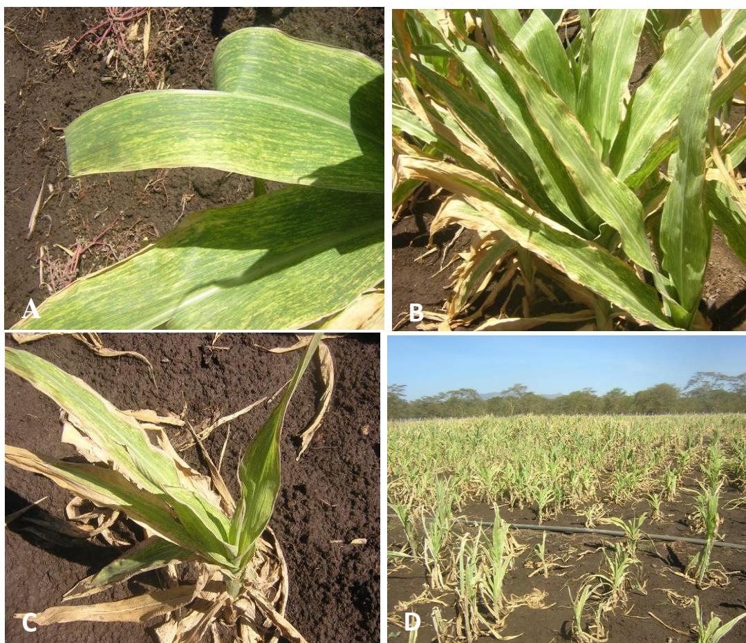
Figure 1. Variable MLND reaction types of maize germplasm at mid-whorl growth stage observed during evaluation; fine chlorotic streaks and mottling throughout plant (A); excessive chlorotic mottling and leaf necrosis (B); near complete plant necrosis (C) and field level infection (D).