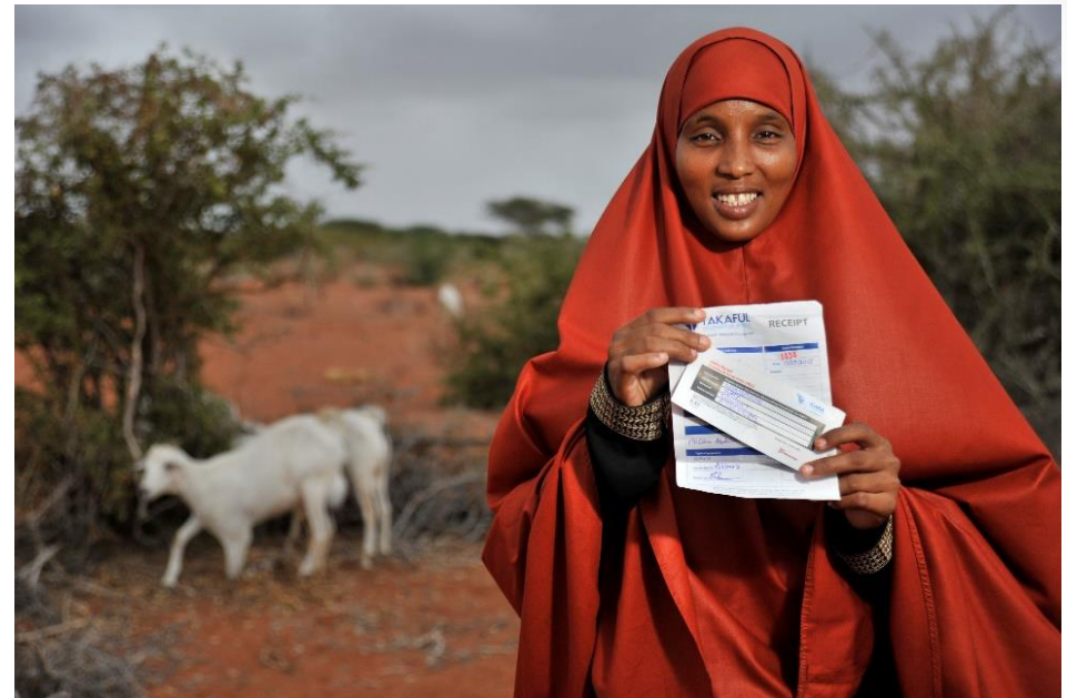
Beneficiary of Takaful insurance payout in Wajir, northern Kenya