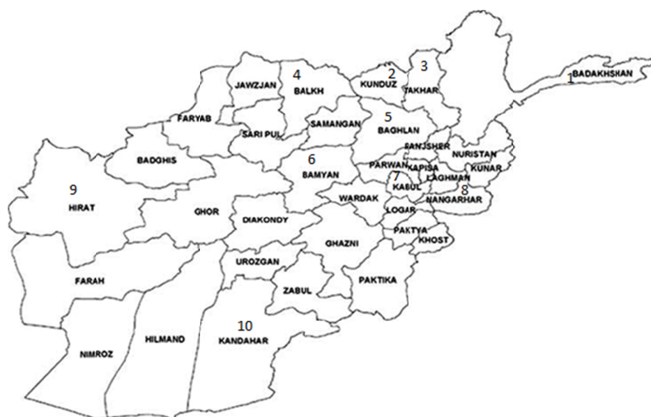
Figure 1. Locations of various ARIA research stations in Afghanistan