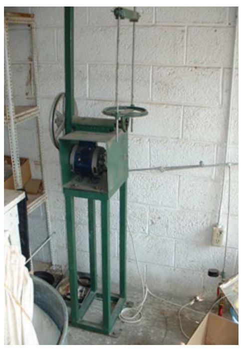
Figure 1. Machine used to shake dry soil samples.